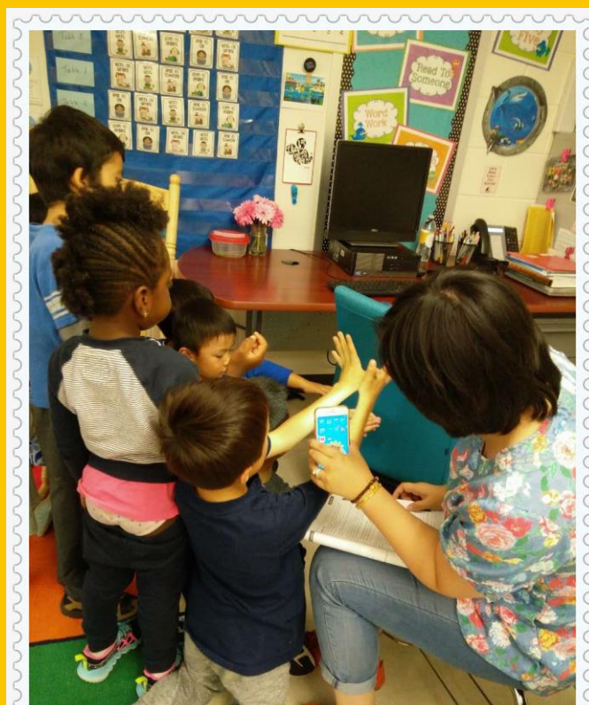
Hand Shadow 手影认动物