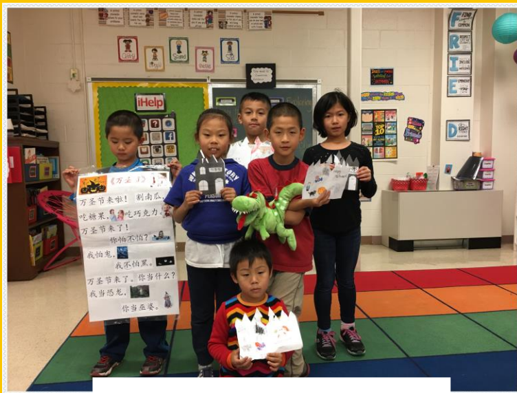
Haunted house 鬼屋