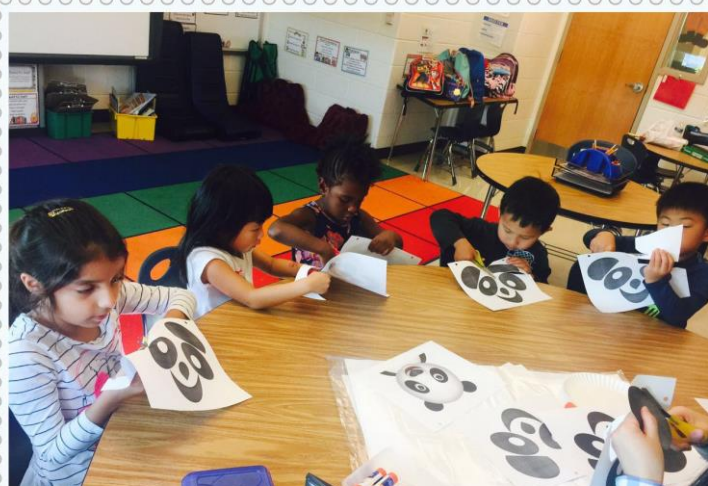
The panda plate 熊猫盘子学五官