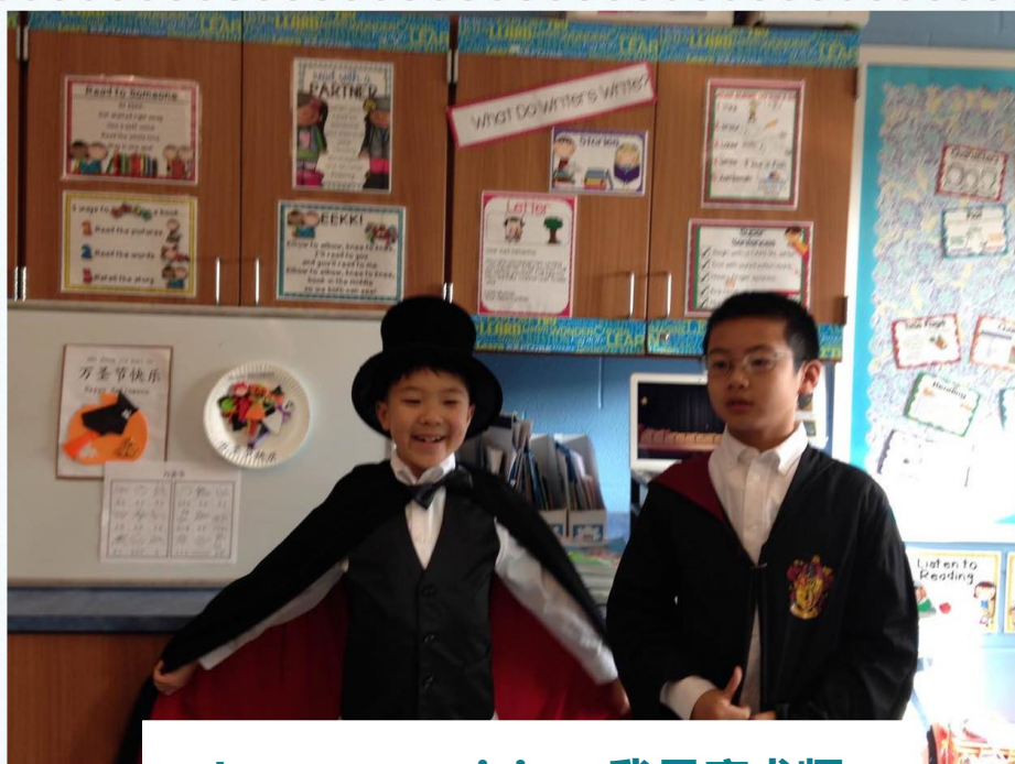
I am a magician 我是魔术师